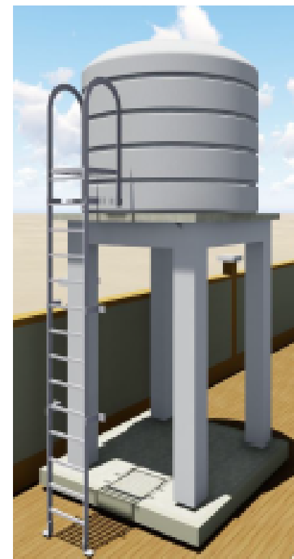
ELEVATED WATER TANK